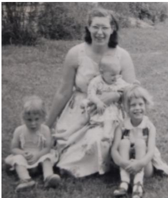
89 years old.