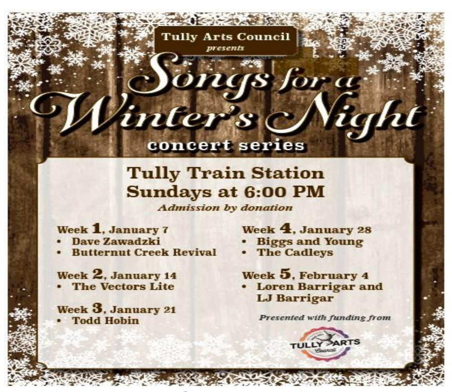
Songs for a Winter Night Sunday evenings, Jan 7-Feb 4 @ Tully Train Station Please join us starting at 6pm.