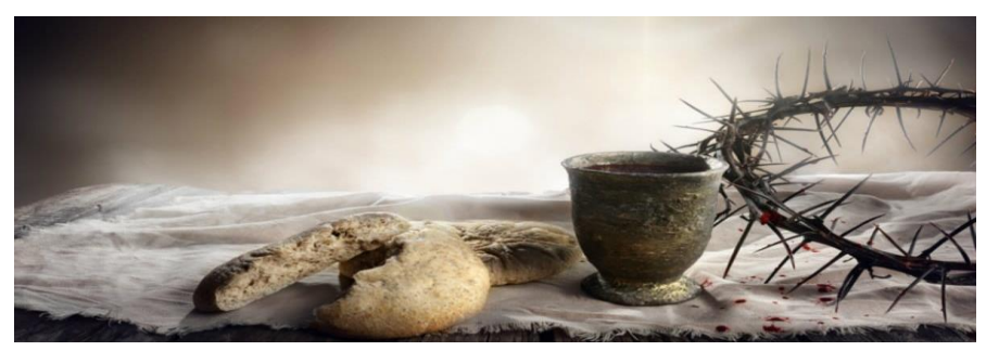
-WE SHARE THE LORD'S SUPPER-

C: Let us share signs and words of peace with our neighbors.